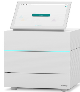
Figure 1: The iSeq 100 System—The iSeq 100 System harnesses the power of NGS in the most affordable, compact benchtop sequencing system in the Illumina portfolio.

The latest innovation in NGS is poised to advance microbiology genomics research. The compact iSeq 100 System (Figure 1) combines complementary metal-oxide-semiconductor (CMOS) technology with proven Illumina sequencing by synthesis (SBS) chemistry to deliver high-accuracy data with fast time to results. The iSeq 100 System is part of a streamlined NGS workflow for targeted and whole-genome microbial sequencing (Figure 2).