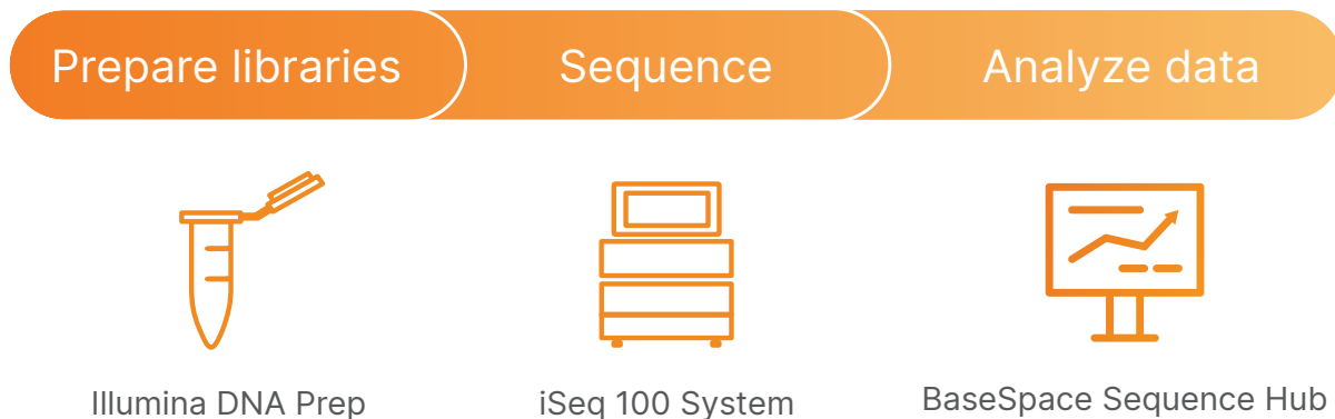
Figure 2: Microbial genome sequencing workflow—Illumina offers a streamlined, comprehensive workflow for microbial WGS that includes library preparation with Illumina DNA Prep, sequencing on the iSeq 100 System, and analysis with BaseSpace core apps.

A major advance in Illumina library prep chemistry, and a key feature of Illumina DNA Prep, is on-bead tagmentation, which uses bead-linked transposomes (BLTs) to mediate simultaneous DNA fragmentation and tagging of Illumina sequencing primers (Figure 3).