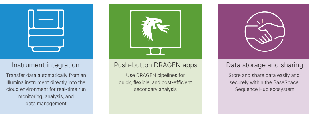
Figure 2: Simplified data analysis—DRAGEN secondary analysis on BaseSpace Sequence Hub couples accuracy and efficiency with simplicity and security.